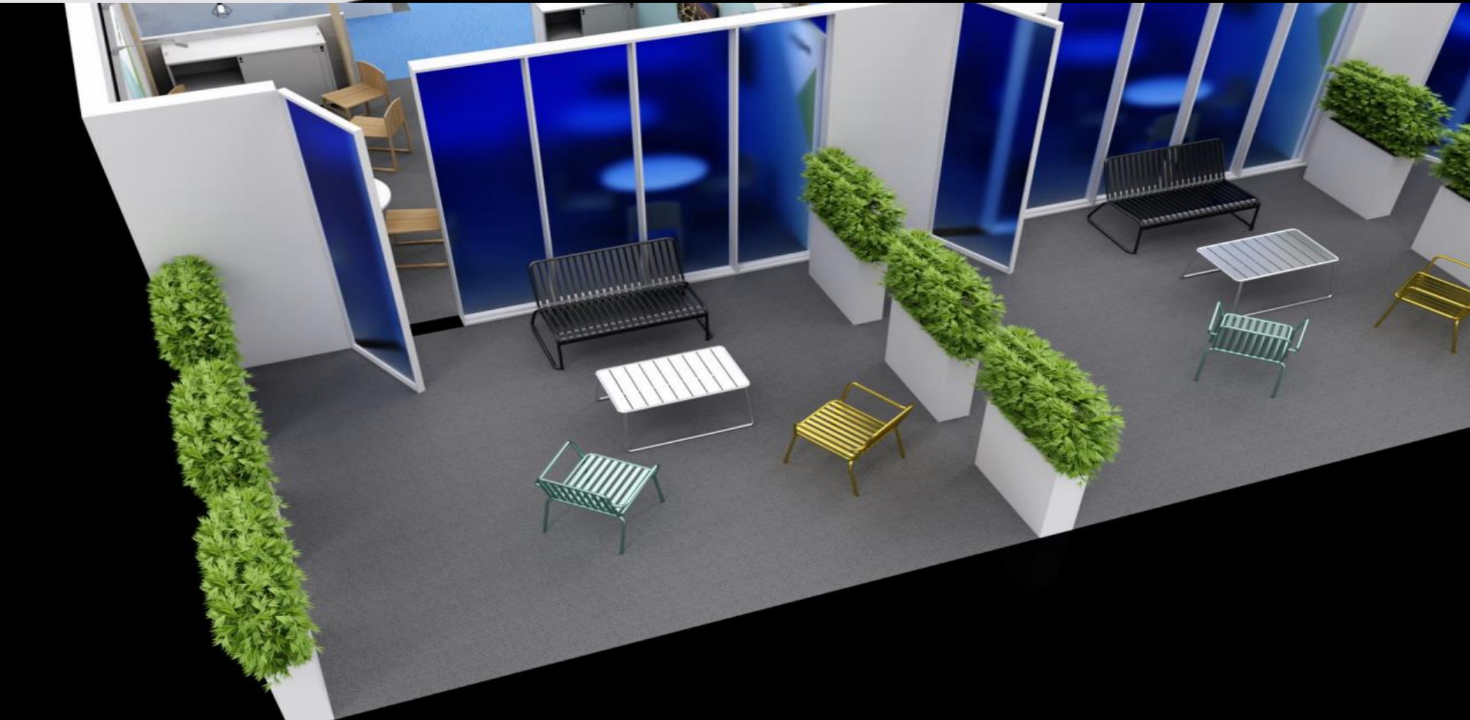
Non contractual 3D models*